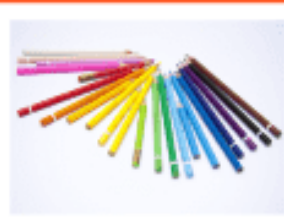
Quiz: Psychology 101 Part 2