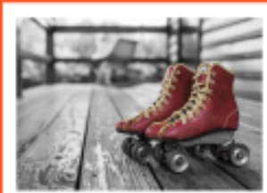
Quiz: Psychology 101 Part 2