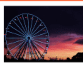
Quiz: Flags in Europe